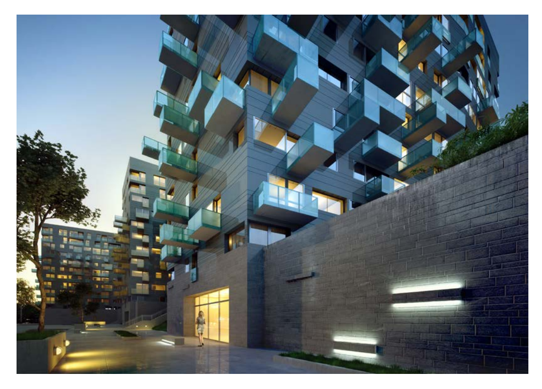
Figure 2: Apartment building in Gdańsk - external view (Source: FORT Taraszkiewicz Architekci Sp. z o.o. in Gdańsk).

The same can be said of large apartment buildings, offering comfortable living conditions in isolated, and well-guarded from unwanted guests, apartments (Figure 2 and Figure 3).