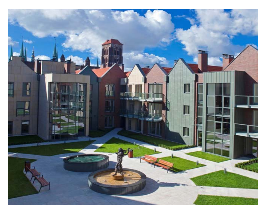
Figure 4: Architecture that can be perceived with all the senses - a housing complex in Gdańsk.

Rasmussen writes about experiencing architecture through such elements as: solid shapes and emptiness, contrasts, colour planes, scale, proportions, rhythm, texture, light or even of hearing architecture [4]. This holistic approach to experiencing architecture with all the senses allows contemporary man to open up to various impressions, and through their perception to reveal his true, individual psychological needs and his true essence. Architecture is my space and, emotionally, only mine (Figure 4).